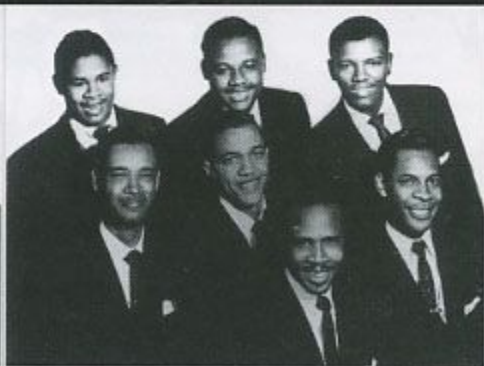
Mighty Clouds Of Joy