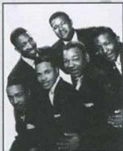
Cross Jordan Singers

Music Club digs deeply into the vast treasures at Hob Records and draws from the vaults the very best in traditional male gospel quartet singing from the 1950s and '60s.